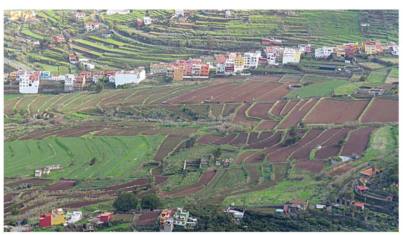
Fig. 3.1 for Question 3