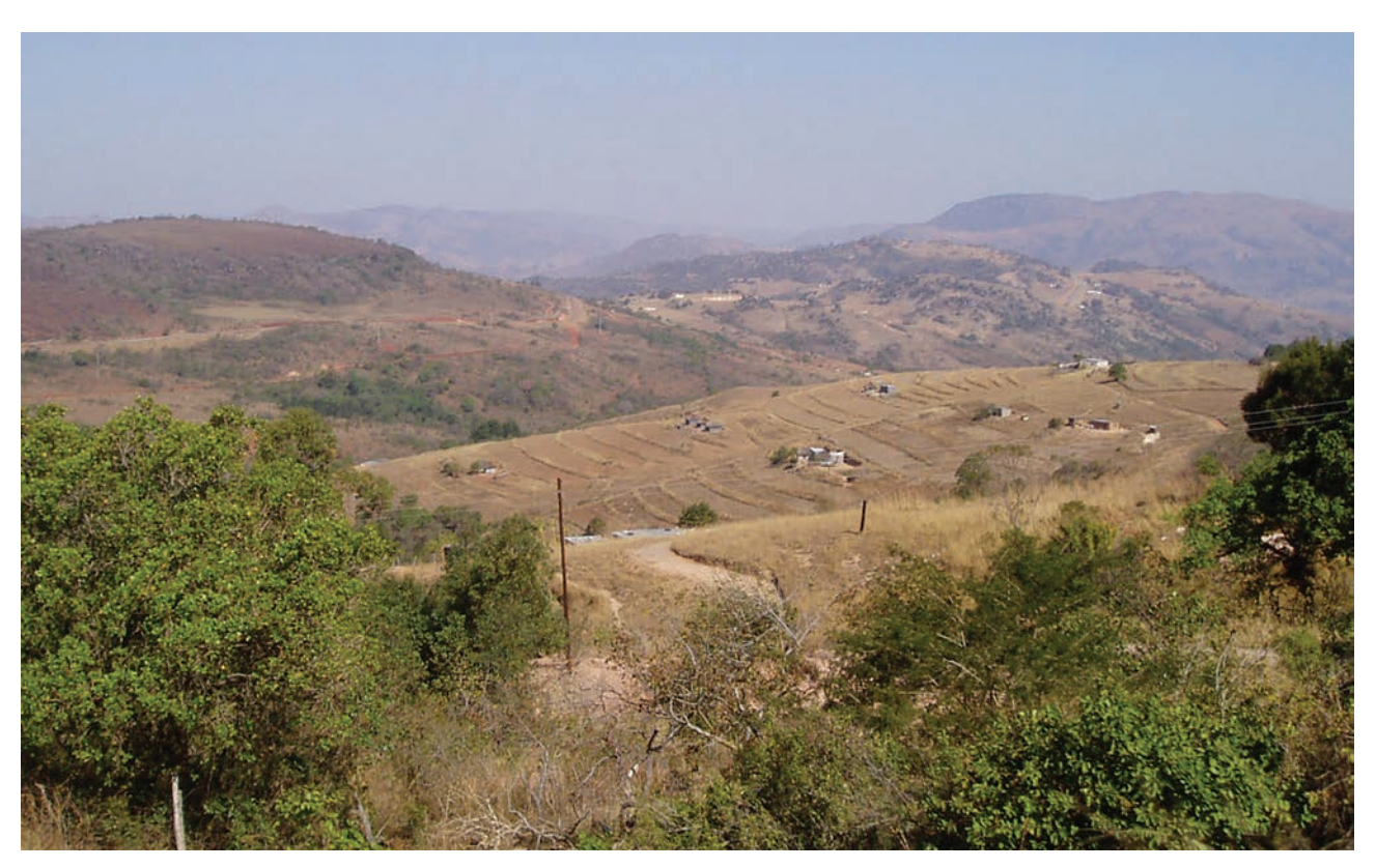
Fig. 3.2 for Question 3